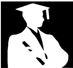
Caption describing picture

rent child abuse/neglect costs at roughly $400 million per year while providing home-based services for families at risk would cost under $25 million 9 . In addition to significant financial savings, prevention would have other benefits for taxpayers, including reduced medical and mental health care usage, lower incidences of violence, and improved educational and vocational